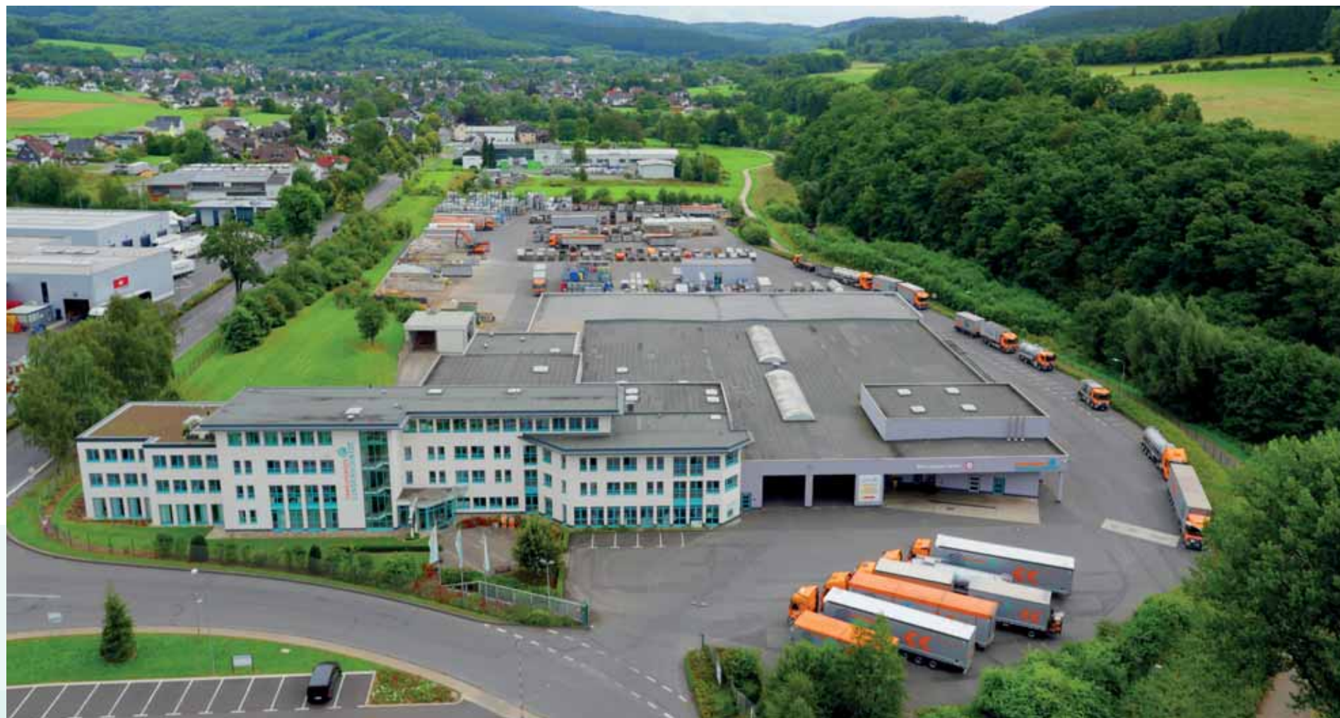
Central Service Centre (DLC) and Central Administration