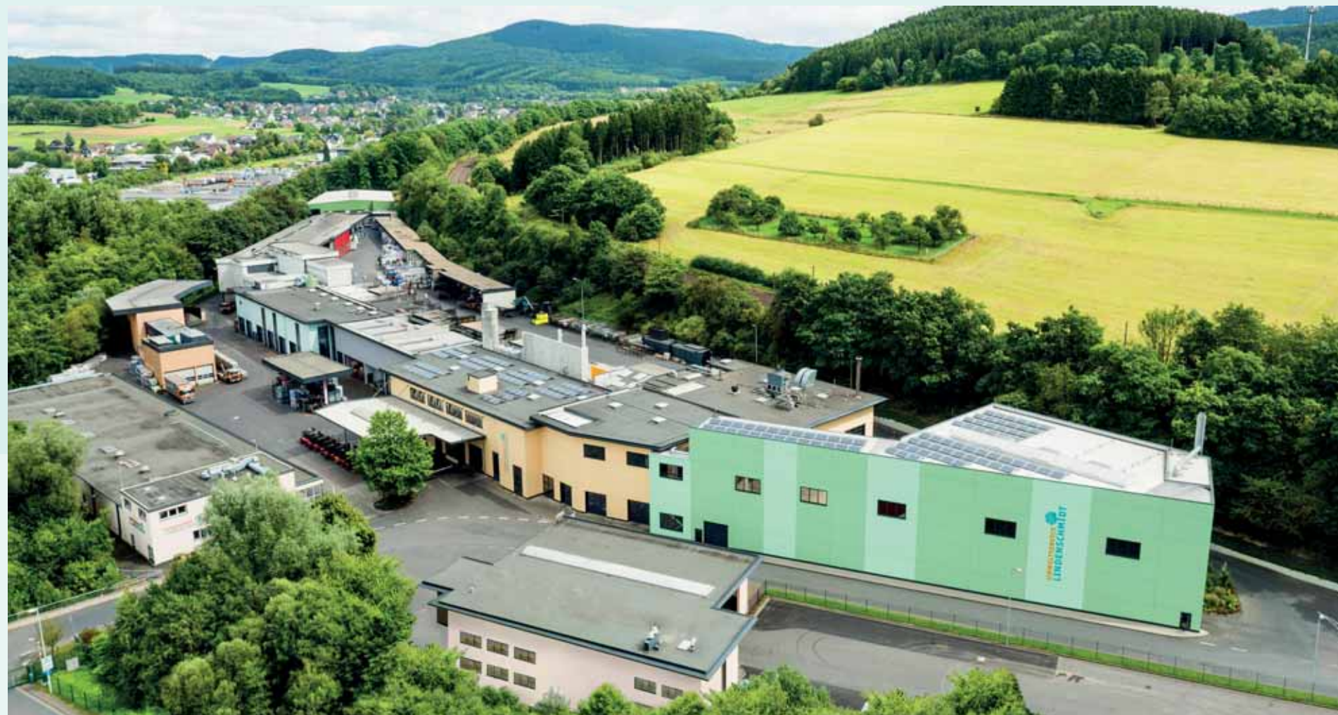
Waste Management Centre (ESC) and laboratory